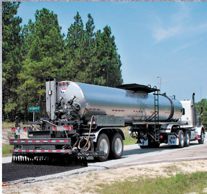
CUSTOM BUILT TANK SIZES